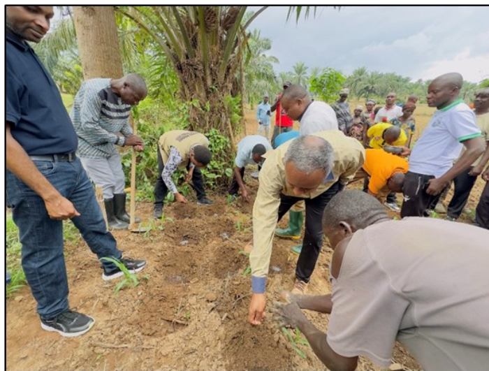
A local government official joined VHW staff and farmers to plant the first peanut seeds last November. Now the plants are ready to be harvested.

Last year, when USAID stopped delivering peanut